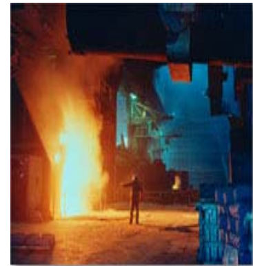
Iron & Steel