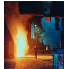
Iron & Steel