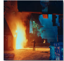
Iron & Steel Pulp & Paper