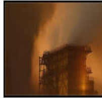
Coke Oven Cement