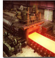
Sintering Plant Lime