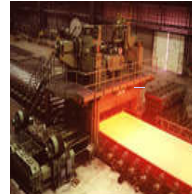
Sintering Plant Lime