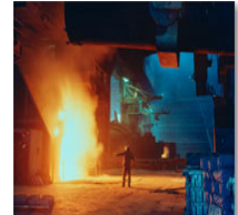
Iron & Steel Pulp & Paper